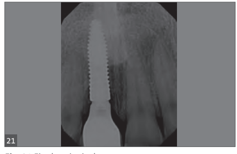
Fig. 21 Final periapical x-ray