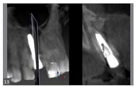
Fig. 13 Post-surgical CBCT of #8; buccal gap bone grafting is noted along with a widened NPF