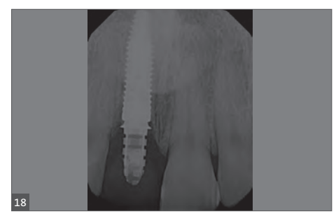
Fig. 18 Periapical x-ray of screw-retained provisional