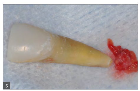
Fig. 5 Extracted tooth #8

Insertion torque value of the implant was approximately 10Ncm as it was hand tightened to final seating. A buccal gap of 2 mm was measured (Fig. 8) and packed tightly with anorganic bovine bone (BioOss; Geistlich) previously soaked for 10 minutes in PDGF (Gem-21; Osteo-Health) to aid in both soft and hard tissue healing.