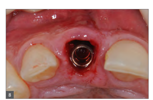
Fig. 8 Flapless placement with along the palatal wall with a 2 mm buccal gap recorded