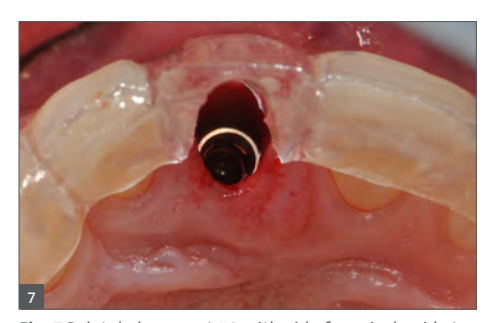
Fig. 7 Palatal placement #8 with aid of surgical guide to allow for a buccal gap of at least 2 mm and a screw-retained restoration