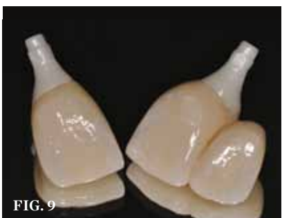
PATIENT 2 (6.) The full smile revealing a low-to-medium lip line. (7.) Retracted anterior view highlighting the soft-tissue architecture. (8.) Pretreatment panoramic radiograph with the template in place. (9.) The final restorations; a screw-retained zirconia abutment and zirconia veneer restorations initially cemented then converted for screw retention. Retrievable screw-retained restorations minimize the possibility of retained cement and eventual tissue complications